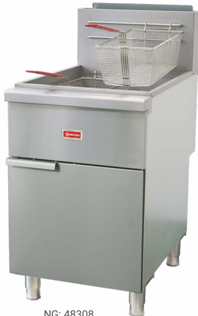
NG: 48308 LP: 48639

Available in Natural Gas and Liquid Propane.