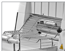
Movable Safety Guard