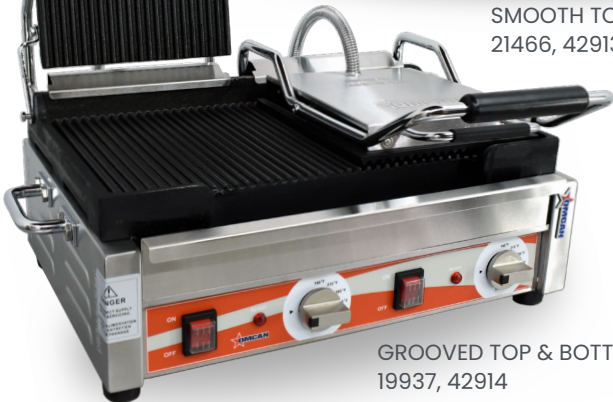
GROOVED TOP & BOTTOM 19937, 42914