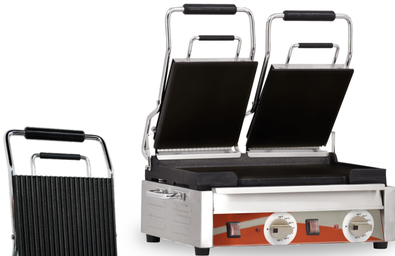
SMOOTH TOP & BOTTOM 21466, 42913