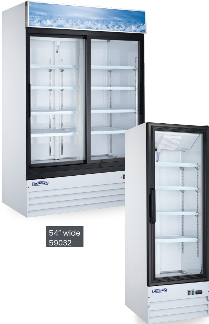
54" wide 59032