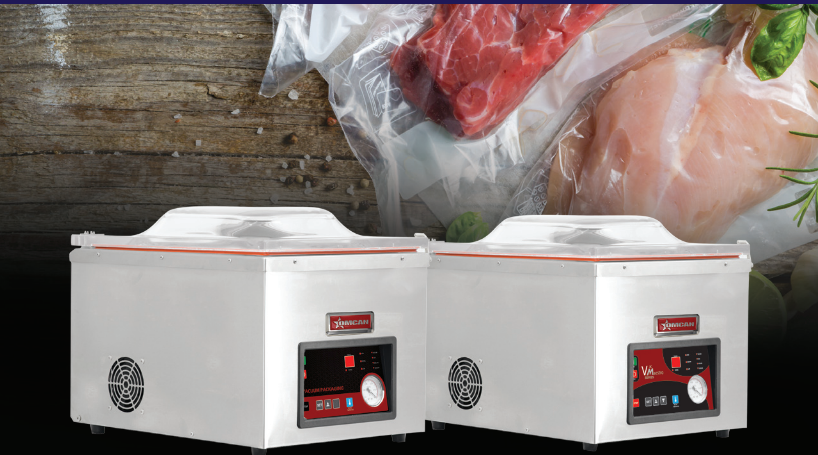
19482 Model: VP-CN-1066