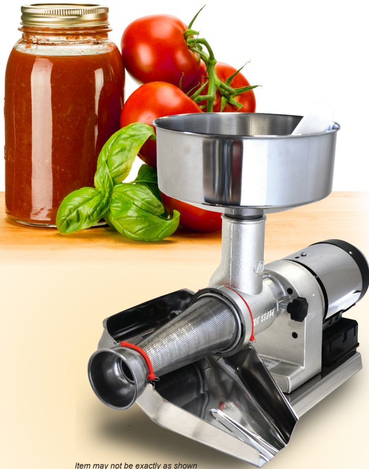
Item may not be exactly as shown