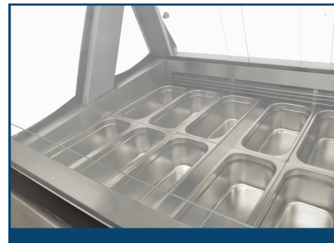
Comes with 12 Quarter-size Pans