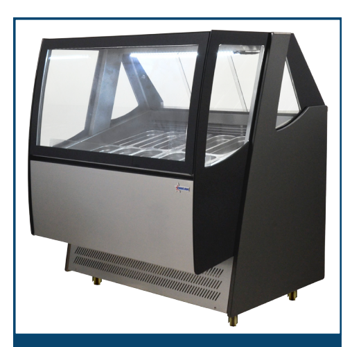
Ice Cream Display with Lights On2 LED Lights (6 Watts each)