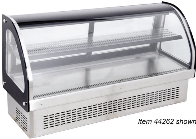
Item 44262 shown