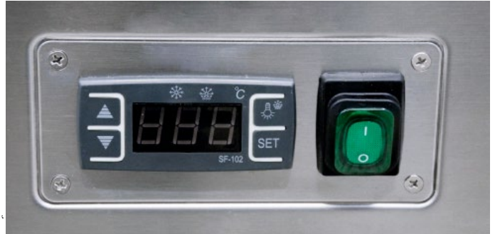
Digital temperature controller & display