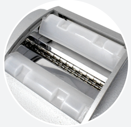
2 Cutters and a Roller